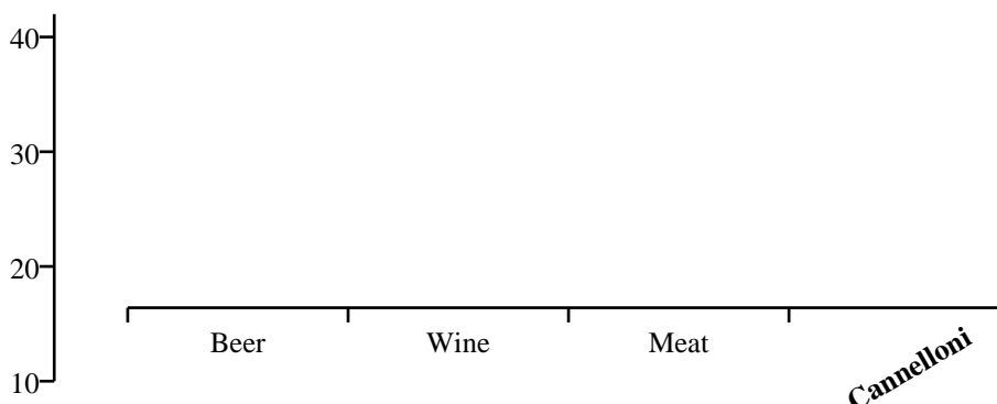
Figure 11-3: Two isolated axes